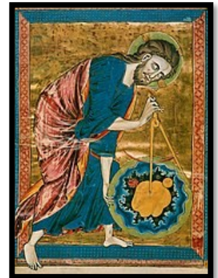
Galileo's Trial Documents

The archive houses notes from the trial against the 17 th -century scientist Galileo, who questioned the Catholic Church's view about the movement of the Earth.