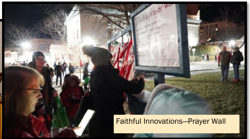
Faithful Innovations—Prayer Wall